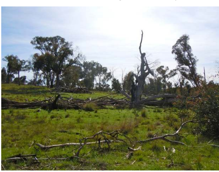
Far left: Hollows in mature box gum trees are important habitat for many bird and other animal species