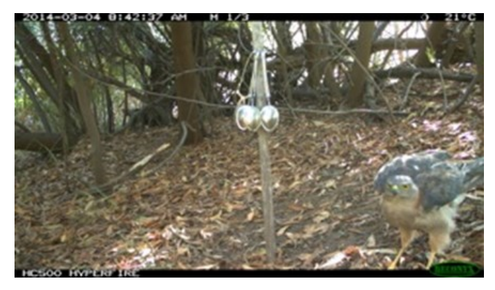
Above: An image captured using a remote wildlife camera on a property near Junee

The infra-red cameras are simply set up in a location of interest with some bait, and left undisturbed for a number of days. The camera will automatically take photographs of any animal which comes to investigate the bait. The camera can then be collected, all photos downloaded to a computer and the species identified.