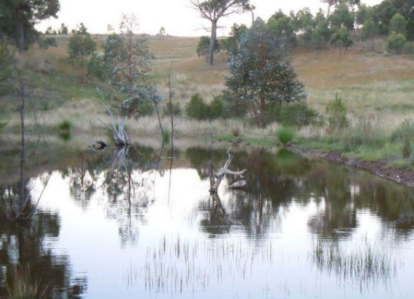
A typical farm dam, with little biodiverse vegetation surrounding it