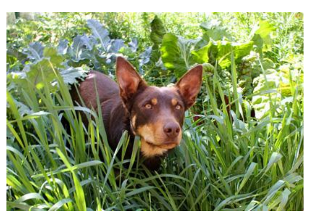
Photo: 7 years and under Winner – Dougall Hughes (Broken Hill, NSW) "Boy in the Spelt Grass" - My sheep dog 'Boy' loves to hide in, and eat the spelt grass I have planted in our veggie garden. Growing next to the spelt are kale plants, spinach, broccoli and tomatoes. Because we live on a sheep station, we grow fresh veggies to keep us healthy.