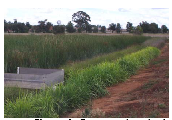
Figure 4: Constructed wetland