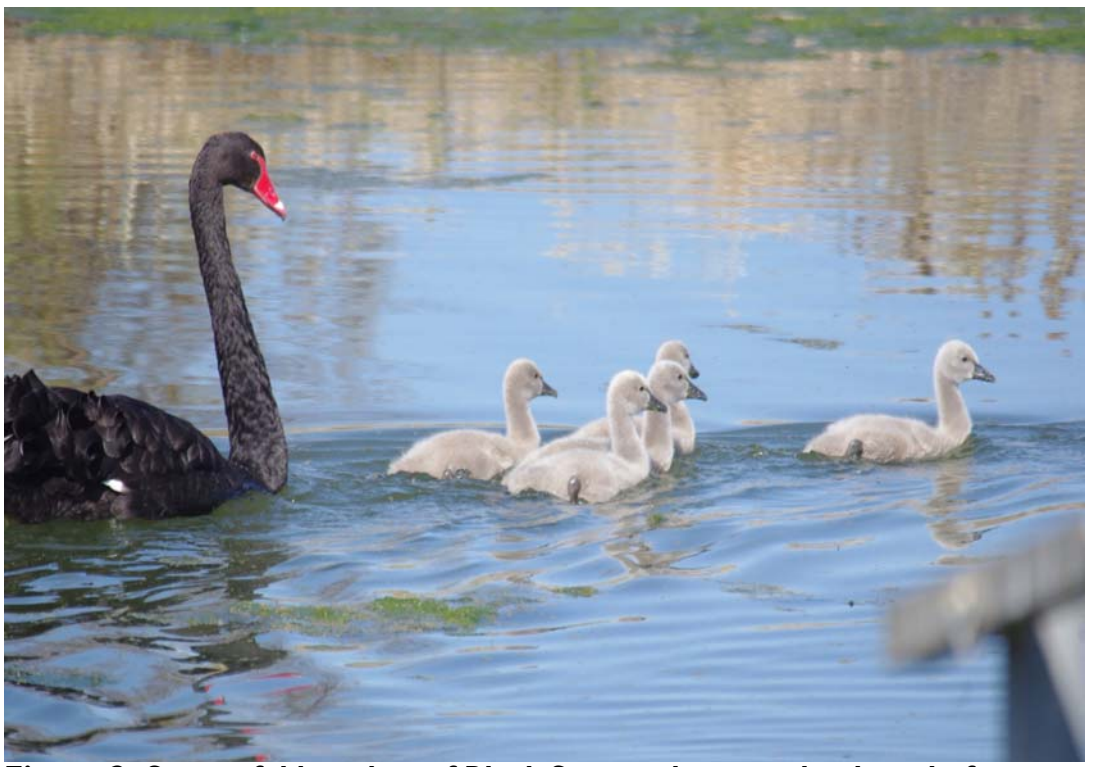
Figure 2: Successful breeding of Black Swan - shown with a brood of cygnets.

Prior to the drought, a flat island in the middle of the storage pond was regularly inundated as the storage reached top water level. When this occurred, considerable amounts of manure, deposited by roosting birds, would be washed into the storage, leading to heightened suspended solid and nutrient levels. The ground nesting birds (such as the Black Swan) would also be inundated despite the birds' best attempts at elevating their nests. This would often result in eggs and/or juvenile birds being washed into the pond and perishing.