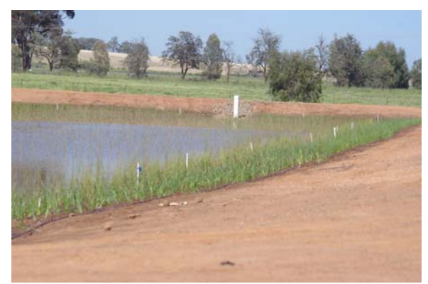
Figure 3: Constructed wetland Oct 2010 Feb 2012

Vegetation establishment took approximately 8 months and during this time there was little impact on effluent quality. However, since establishment, we have observed reductions in all effluent quality indicators, the largest reduction being in the level of suspended solids and BOD (refer to <u>Table 2</u> and <u>Table 3</u>). An additional achievement has been a reduction in water temperature; an important factor in the prevention of algal blooms.