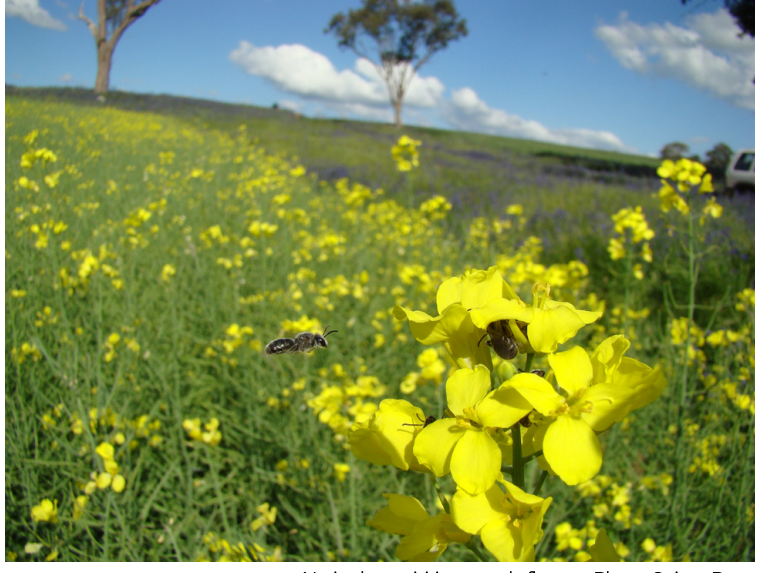
Native bees visiting canola flowers.

Farmers and interested community are invited to a special field trip near Junee with a focus on the extraordinary role bugs and beneficial insects play in the farming landscape. Three highly regarded presenters will share their knowledge gained from extensive research on bugs and biodiversity and the many benefits they bring to agricultural production. We will also look at the optimum design of shelter belts & techniques for the restoration of riparian areas with some practical takeaways on species types for participants to apply to their own farms.